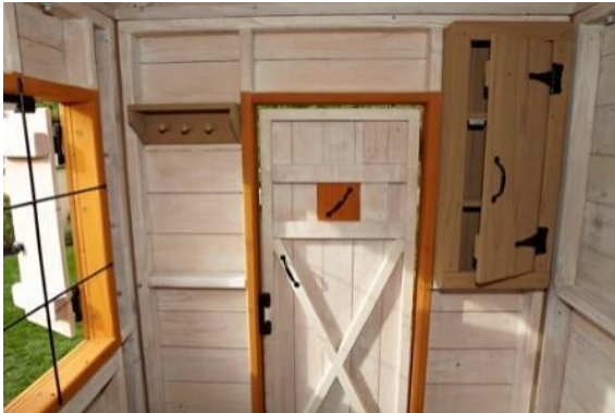
Interior view of single wall construction with exposed frame, and window openings with shutters