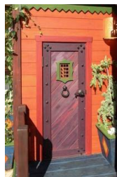
1x6 Redwood T&G siding (Wizard's Hideout)

Optional: Add hand-hewn redwood window screens, for an additional charge.